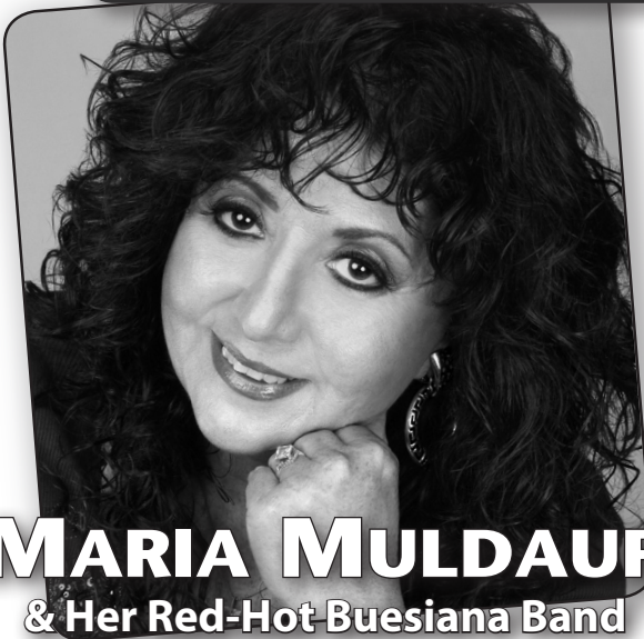
MARIA MULDAUR & Her Red-Hot Buesiana Band

NETWORK • LEARN • DANCE • FOOD • DRINKS • ENJOY